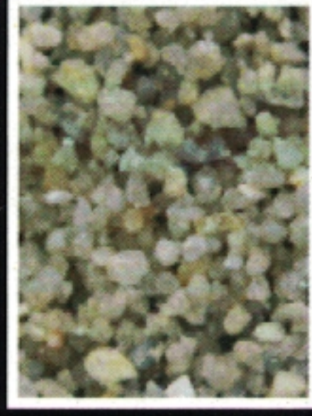
8 Anakie Terracotta Toppings