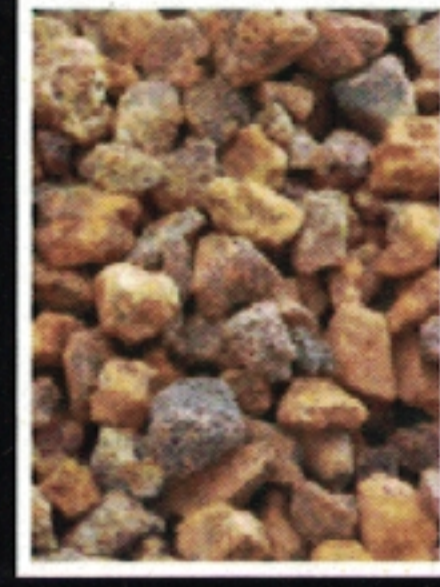
6 Aerostone Red Toppings