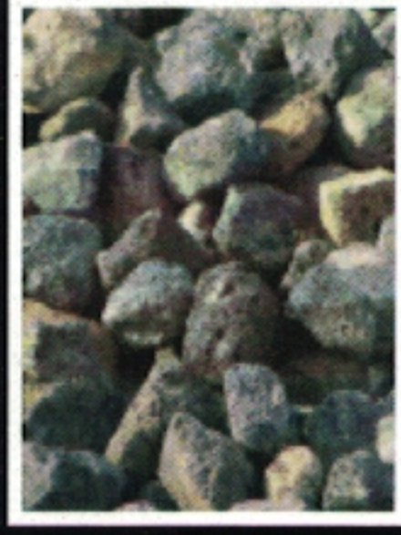
7 Anakie Toppings