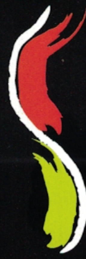
13 "Aerostone Coloured Mulch" - coloured landscape mulch range